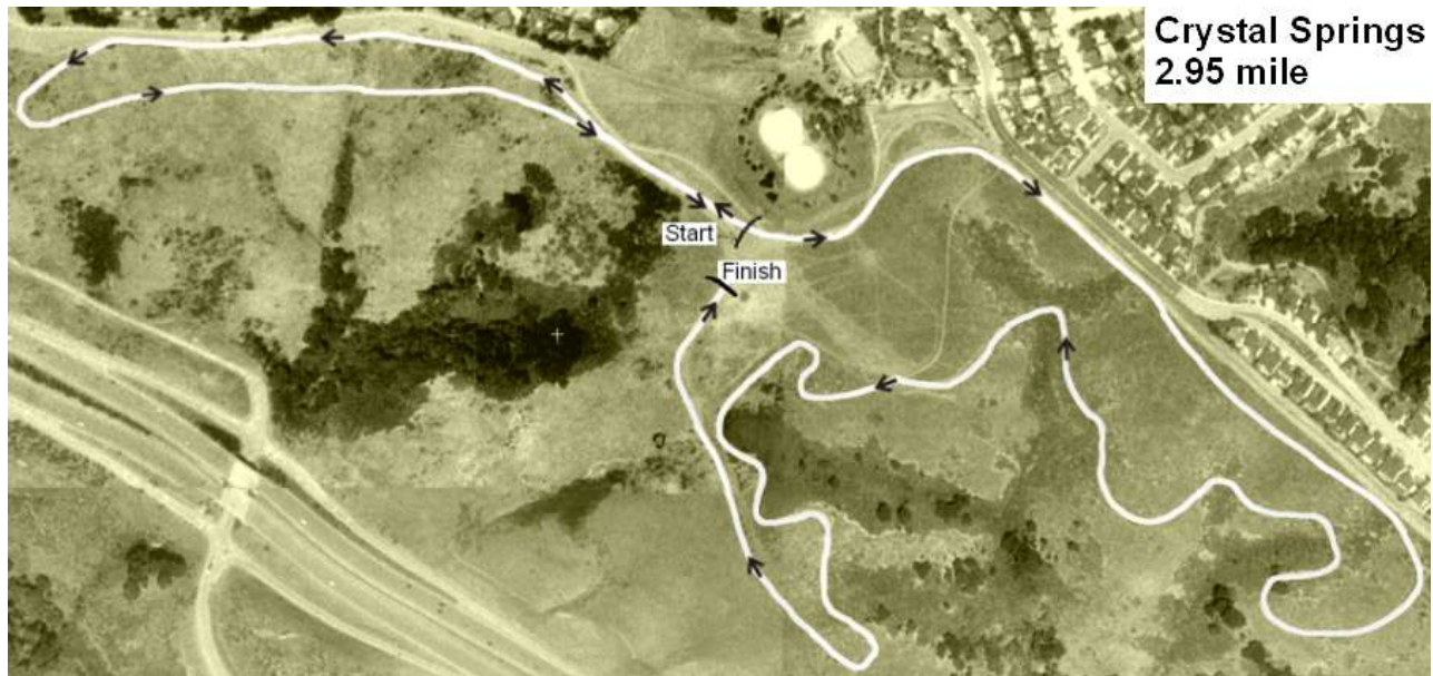
Crystal Springs 2.95 mile